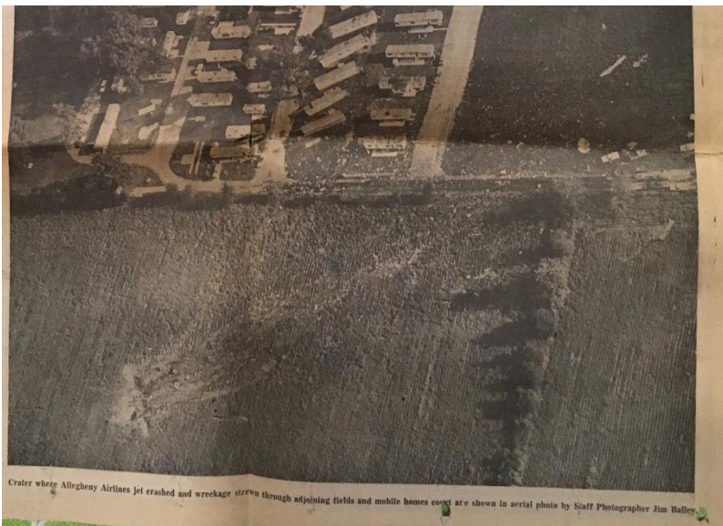
Crater where Allegheny Airlines jet crashed and wreckage strewn through adjoining fields and mobile homes coast are shown in aerial photo by Staff Photographer Jim Bailey.